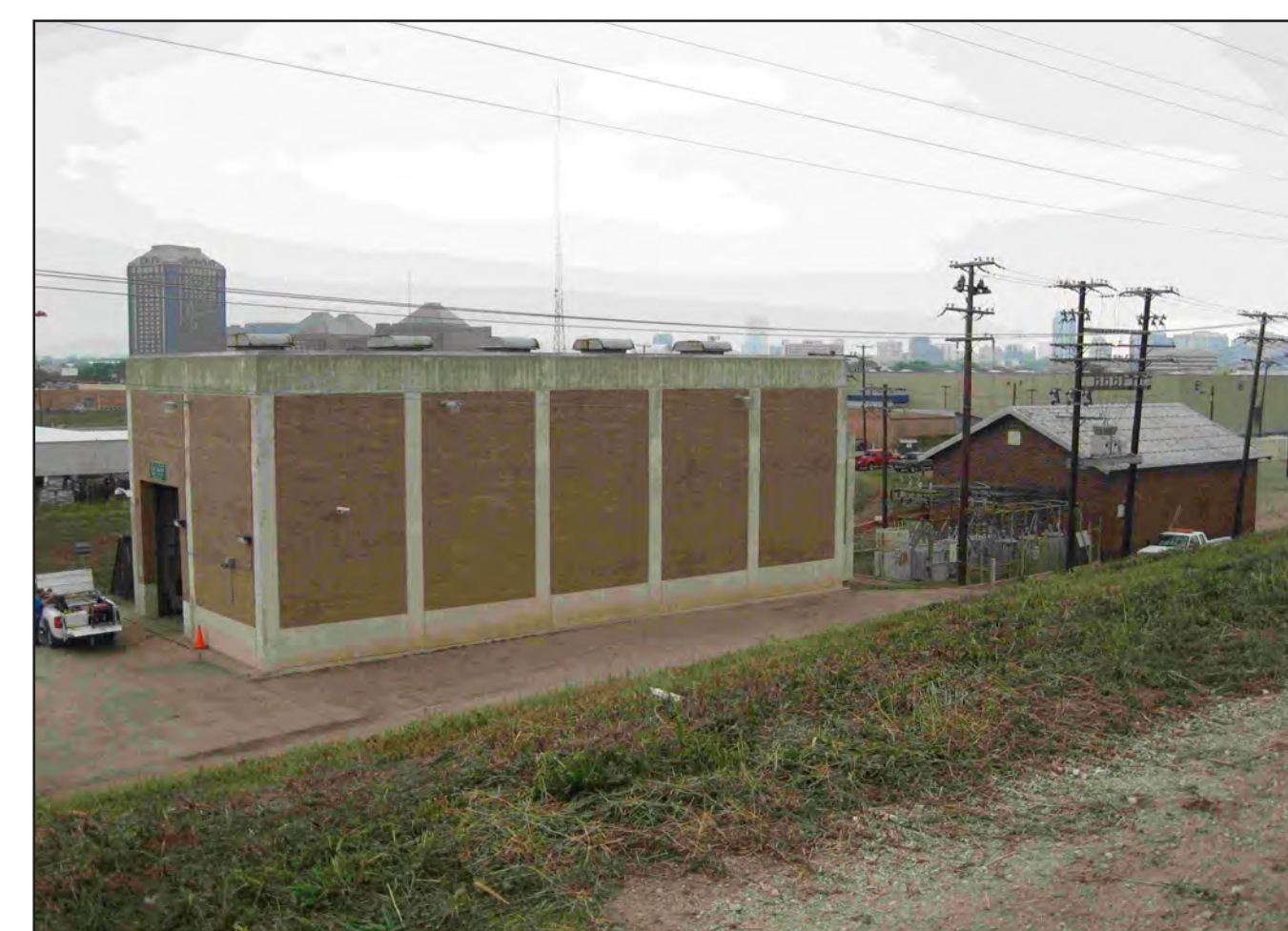
New and Old Baker Pump Stations