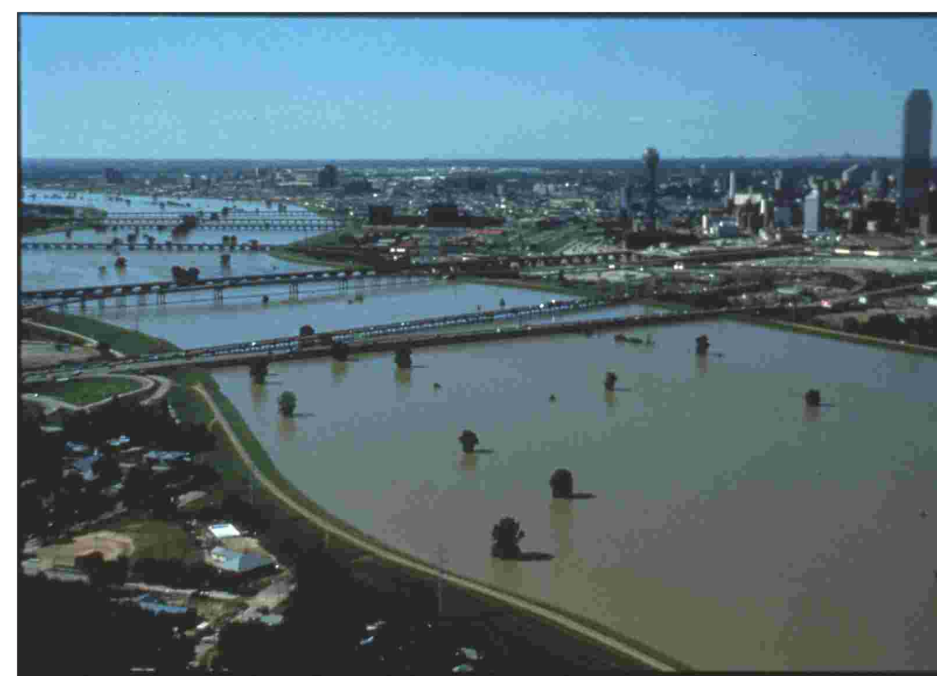
Dallas Floodway during 1990 Flood